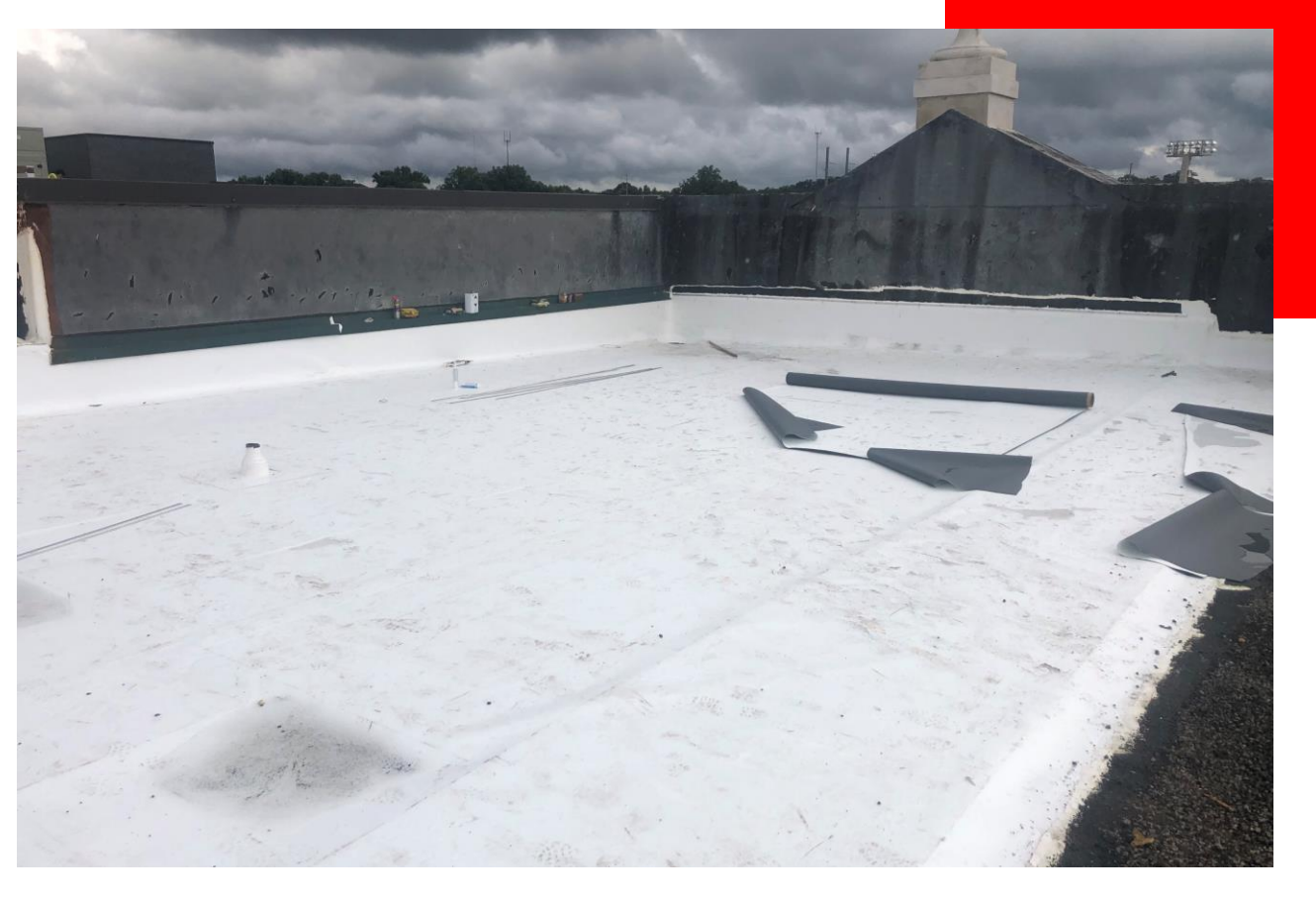
Charles Allen Building Roof Replacement