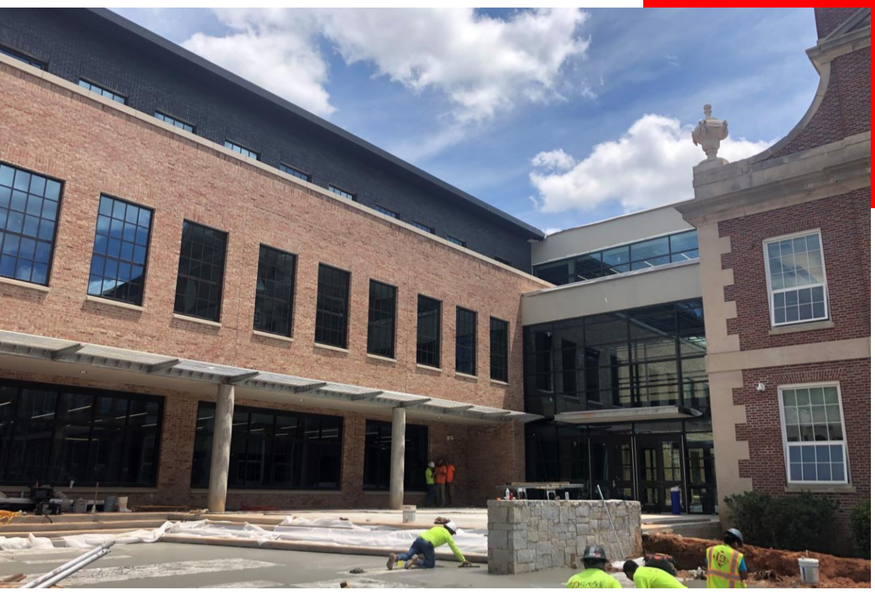
New Addition South Elevation Hardscapes Complete