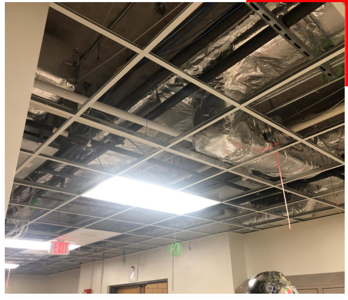
MEP Overhead Progress in C. Allen Building